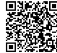
Major List of Doctoral Programs