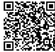
Major List of Master Programs

Scan the QR code below to see the 2024 Major List of Postgraduate Programs for International Students at Beihang University.